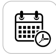
Day and Time of Access