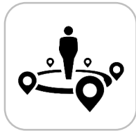
Geolocation of Access